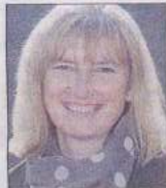
Dr Sarah Wollaston MP